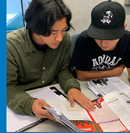
English, Numeracy, TESOL, AMEP and Training and Assessment